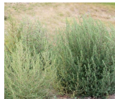
Figure 3: Mature kochia