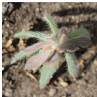
Figure 2: Underside of kochia rosette

Flowers: Inconspicuous since they lack petals but have five sepals. Flowering can occur from July to October.